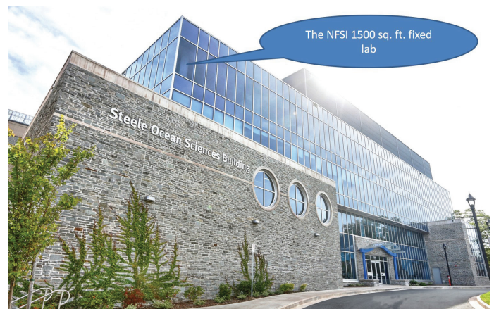
Figure 3. Location of the newly completed fixed BBOBS laboratory at the top floor of the Steele Ocean Sciences Building, Dalhousie University. This laboratory also serves as the headquarters for the NFSI.

A fully mobile BBOBS facility with the 120 instruments will provide multi-dimensional benefits. For controlled source seismic surveys, in addition to being able to acquire longer profiles or cover larger areas, it