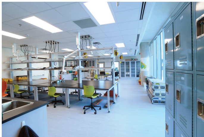
Figure 4. View at the NFSI lab from the main entrance. The two doors at the very back lead to two data analysis rooms.

Development of the fixed BBOBS laboratory in the Steele Ocean Sciences Building at Dal (Figures 4 and 5) has been completed. Tests of the prototype instruments are expected in late Fall of 2019 or Spring of 2020, with the full 120 BBOBS pool and facility test taking place about a year after. Normal operations of the NFSI will start once the full facility test is completed. A web-accessible database that will host all future BBOBS data is under construction with the existing OBS and academic multichannel seismic (MCS) data from offshore Atlantic Canada currently being deposited to prevent their loss and to test the database design and functionality.